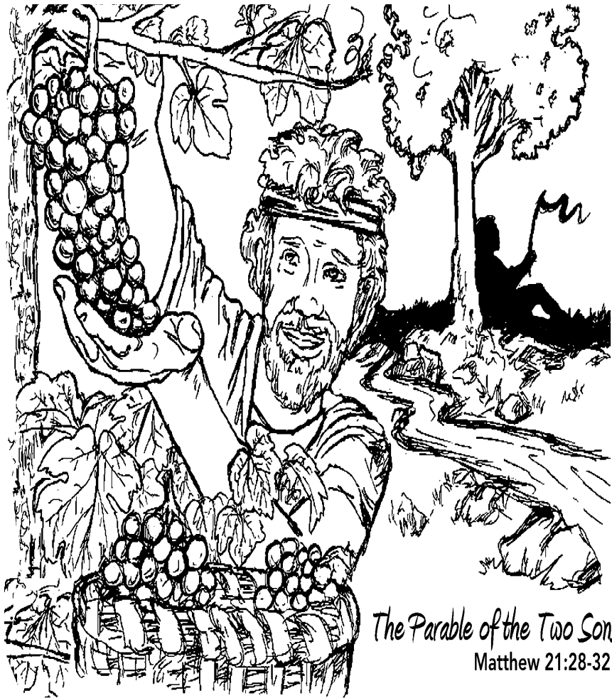
The Parable of the Two Sons Matthew 21:28-32