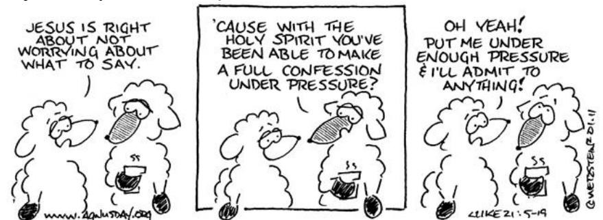
"Agnus Day appears with the permission of www.agnusday.org"